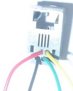
Figure 2.2 Handset wire connection to the standard 616E jack.